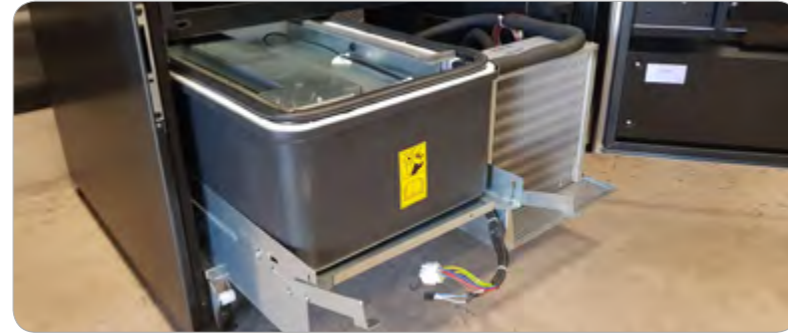
Slide out Refrigeration Unit